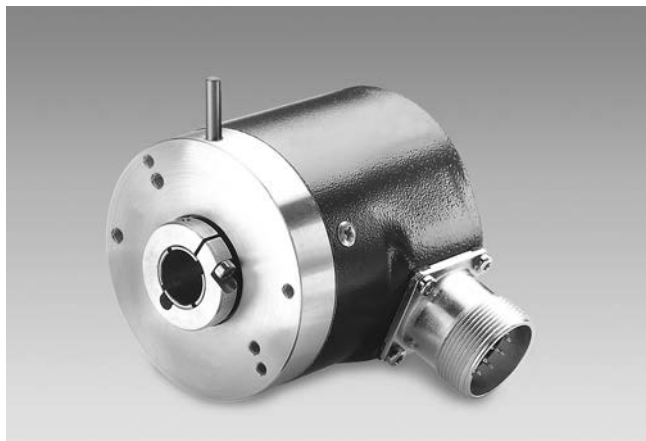
G0P5H with through hollow shaft