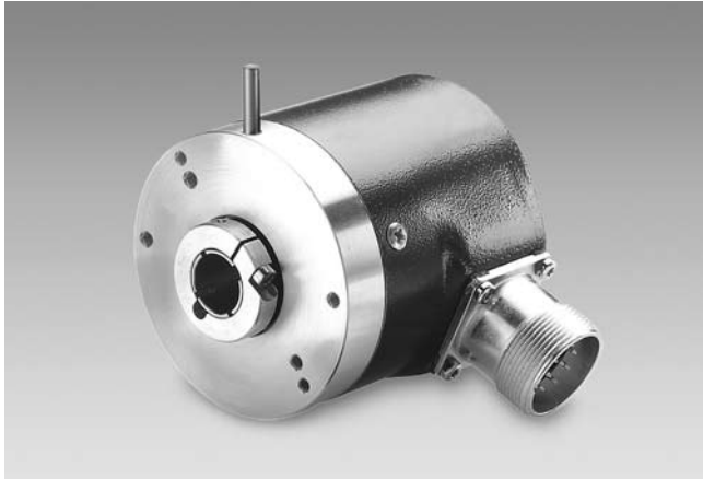
GXP5S with end shaft